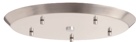
5 Pendant Round