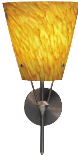
Tahoe Pine Amber