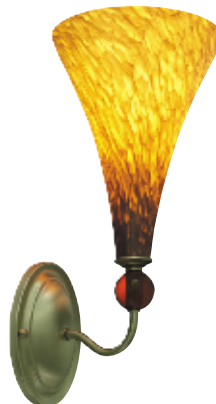
Tahoe Pine Amber w/ Amber Glass Ball