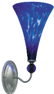
Blue-Violet w/ Blue Glass Ball