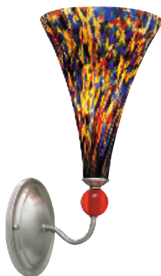
Multicolor w/ Red Glass Ball