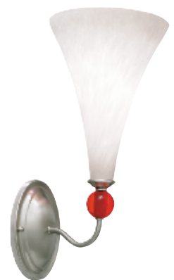
White Frit w/ Red Glass Ball